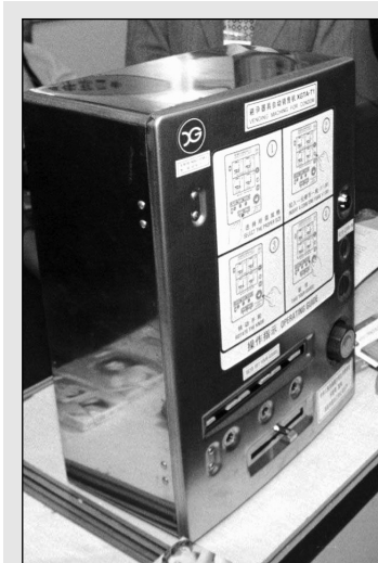
SPARE CHANGE: In China condom vending machines were made available in hotels, drug stores and other shops.

*Look out for the upcoming edition of Spress Issues , on homosexuality.